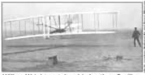
Wilbur Wright watches his brother, Orville, make the world's first successful powered, controlled flight on Dec. 17, 1903.

In 2003 Americans will be celebrating several events that changed the world.