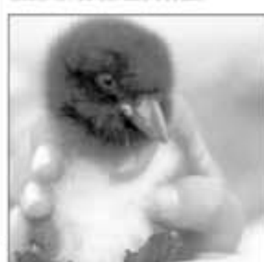
Once they grow up, pufflings may fly hundreds of miles from their nesting site to live on the ocean.

Adult puffins usually spend the winter on the ocean, returning to land in the summer to breed. Scientists know very little about their lives on the ocean.