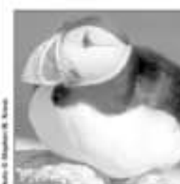
Puffins' big bright-orange beaks and black-and-white feathers have earned them nicknames such as "clown of the ocean" and "sea parrot."

Puffins are great swimmers. When they dive for fish, they can stay underwater for as long as one minute. They use their wings to swim, seeming to fly under water. They can drink salt water from the ocean, and they eat small fish.