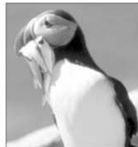
The Atlantic puffin's big beak is useful for carrying small fish home to feed its young. The known record for the most fish in one Atlantic puffin's bill is 62.