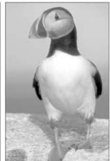
Adults are about as tall as a quart of milk, and weigh about as much as a can of soda.