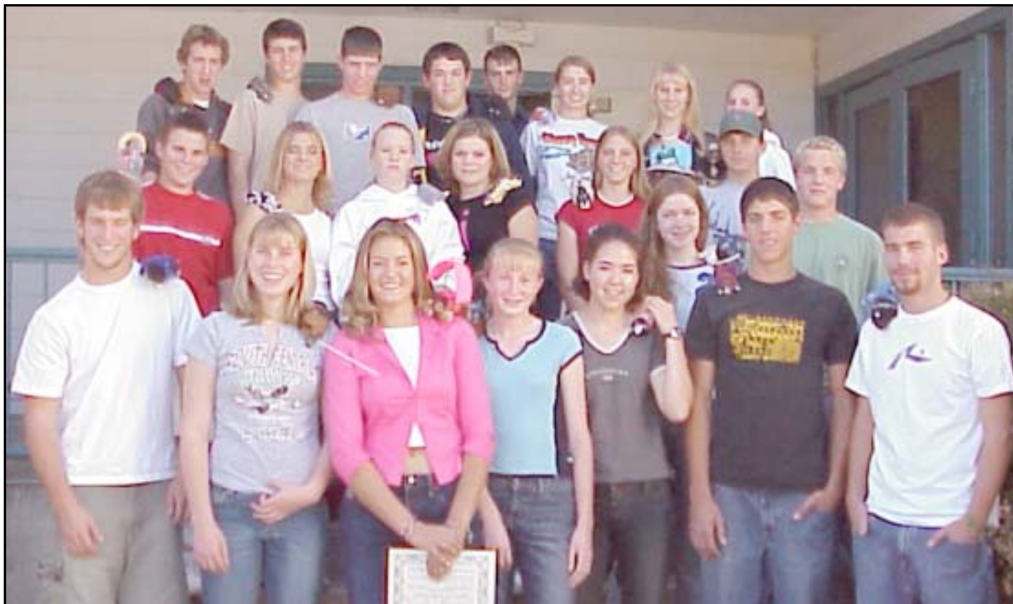
Students provide shoulder for furry friends used in Fall River High School chemistry class.

At a growth rate of 20 moles per year, it will take her just about 3 \times 10^{22} years to leave her classroom... overflowing with cute, happy and intelligent moles.