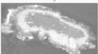
Scientists can use what they learned from restoring the Eastern Egg Rock colony to help other seabirds.

Project Puffin helps moved puffin chicks, or pufflings, from Newfoundland, Canada, to Maine. When these pufflings grew up, they returned to their new home to breed. The Maine colony has been restored.