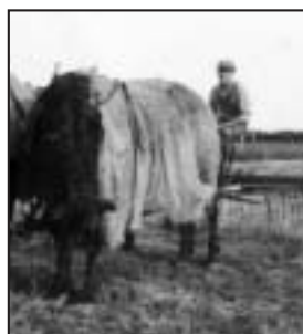
Orphan Train children were city kids who had no idea how to live in the country. It was often hard to adjust. Here a boy learns to work in the fields of Kansas.

Children were not allowed to communicate with their living parent or other family members. Most children never knew what happened to their parents. Most parents never knew if their children ended up happy.