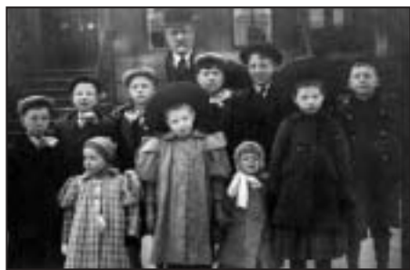
Children who were chosen for the Orphan Trains were told the night before they were going. They were given a bath and allowed to pick out one or two changes of secondhand clothing.

About 125 kids were on each train, with a few Children's Aid agents traveling with them.