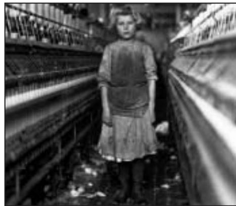
Many poor children worked in factories. Others were forced onto the streets. In addition to the great number of immigrants with no jobs, the Civil War, poor health and accidents all added to the poverty.

Most orphanages accepted children only when a family member could pay for their support. There was a Foundling Hospital, but it cared for children only from birth until they were 3 or 4 years old.