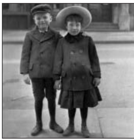
These children in New York City wait for the train that will take them to what they hope will be a better life in the country.